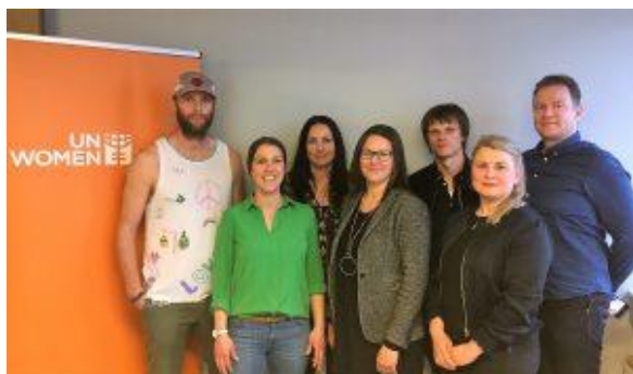
Photo caption: Some of the members of the Board of Directors of the Icelandic National Committee for UN Women in April 2018.

The National Committee for UN Women in Iceland is the first national committee established to support the organization's work and one of the most active. The national committee is a strong voice on advocating for gender equality and a dynamic fundraiser leading in national committee financial contributions to UN Women.