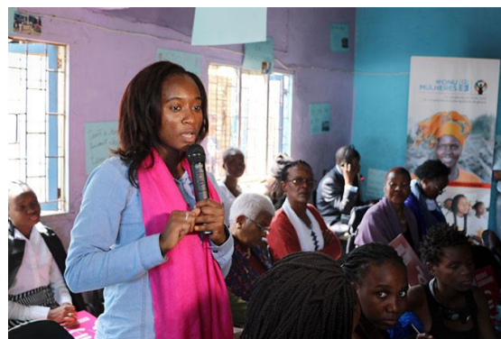
A member of a civil society organization speaks at an event in Mozambique.

In Mozambique , with Iceland's support, and as part of the programme "Promoting Women and Girl's Effective Participation in Peace, Security and Recovery in Mozambique", UN Women is working with national and local governments to prevent and respond to gender-based violence. One of the critical outputs of the programme is that women and girls affected by violence have better and increased access to comprehensive redress services such as appropriate protection, health and psychosocial as well as legal services. This programme continues through December 2020 and focuses on women and girls in affected areas in four districts.